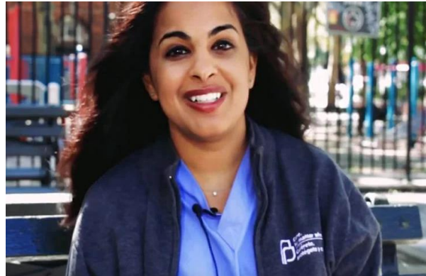
A proud nurse/abortionist at a NY Planned Parenthood.